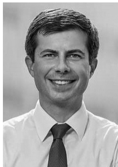
Pete Buttigieg , Mayor of South Bend, Indiana, will receive the Golden Heart Award for Outstanding Leadership and Public Service.