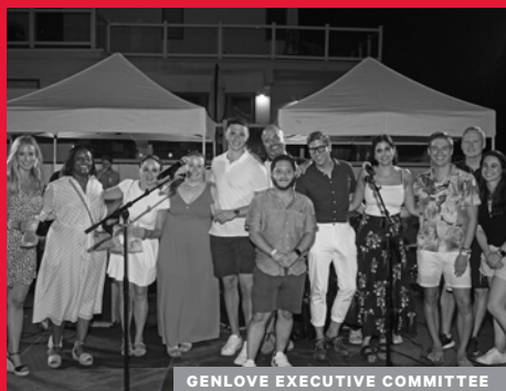
GENLOVE EXECUTIVE COMMITTEE