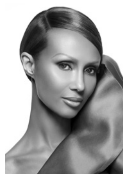
Supermodel, entrepreneur and philanthropist Iman will receive the Michael Kors Award for Outstanding Community Service.