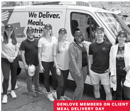
GENLOVE MEMBERS ON CLIENT MEAL DELIVERY DAY

Through the years, our supporters have found countless meaningful ways to support the clients of God's Love. Through volunteering, donating, and simply acting as ambassadors, you have done so much to make sure we can always be there for our neighbors living with severe and chronic illness. This year we were honored to receive support in some very unique ways thanks to our wonderful friends.